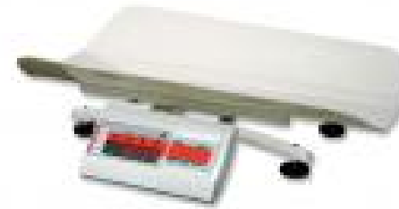
electronic scale for weighing babies