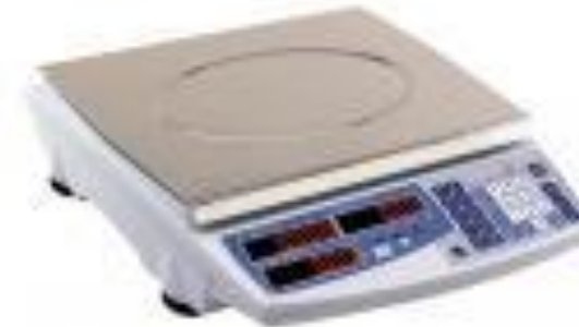
Technical and counting scales