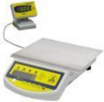
Electronic letter scales

Today, they manufacture modern electronic scales, which can be used in many different sectors of economy, such as trade, industry, services, transport and other.